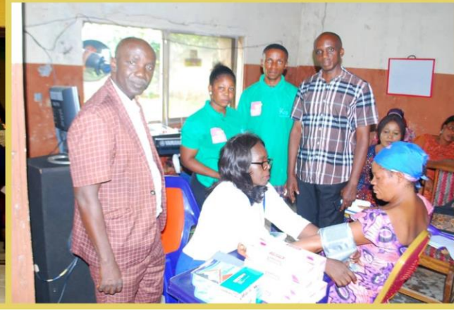
Biocodex Microbiota Institute