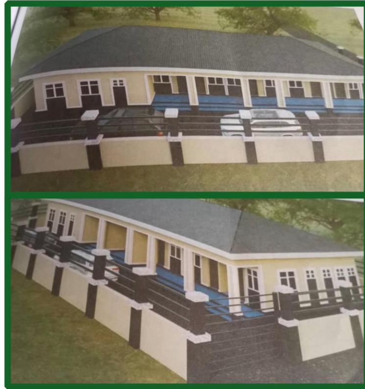
Biocodex Microbiota Institute